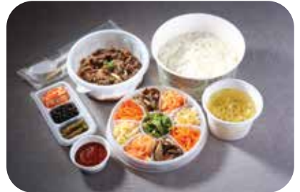
Beef Bulgogi + Bibimbap