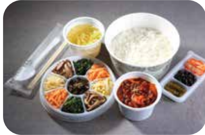
Octopus + Bibimbap