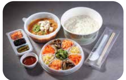
Rich soybean Paste Stew + Bibimbap