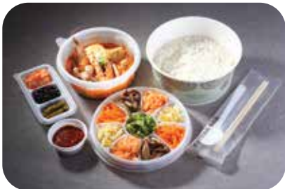
Soft Tofu Stew with Seafood + Bibimbap