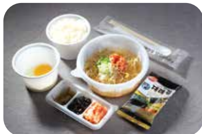
Bean Sprouts Soup