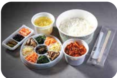
Stir-fried Pork + Bibimbap