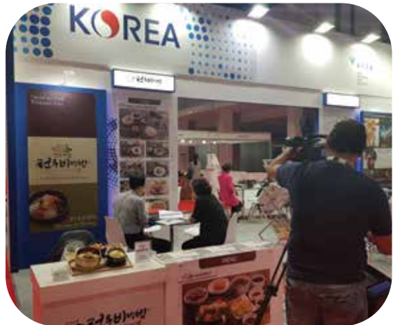
International Franchise Exhibition in Abu Dhabi