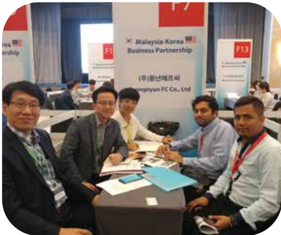
Malaysia-Korea Business Partnership