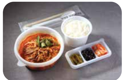
Yukgaejang (Beef Stamina Soup)