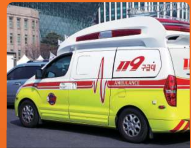
Action of Police or 911

This system is used to determine emergency situation by recognizing sound generated in various emergency situations, such as rescue requests or screams.