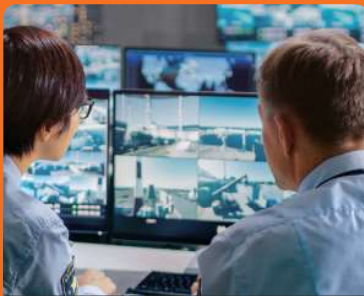
Video pop-up & Monitoring & Analysis