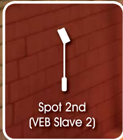
Spot 2nd (VEB Slave 2)