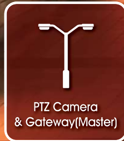
PTZ Camera & Gateway (Master)